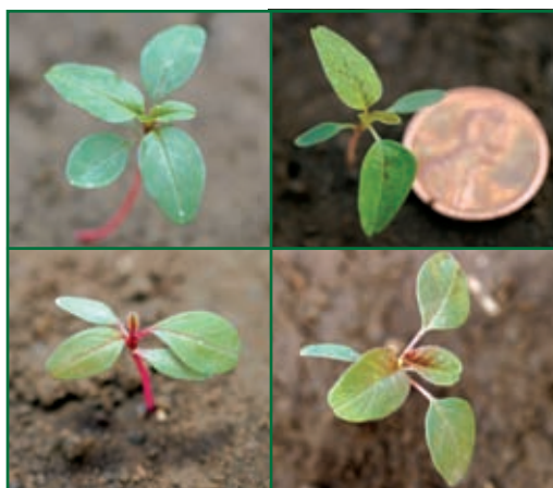
Figure 1. (Clockwise from top left) Seedlings of waterhemp, Palmer amaranth, redroot pigweed, and smooth pigweed.