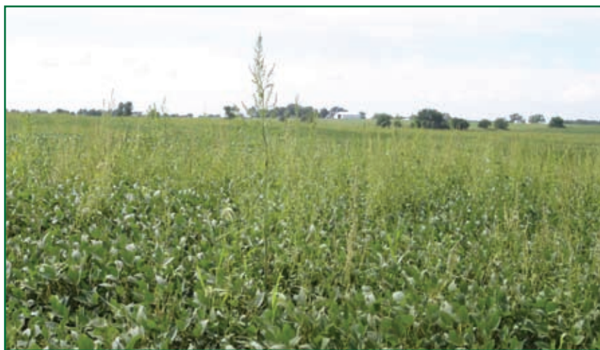
Figure 5. The waterhemp plants shown here developed three-way multiple herbicide resistance — to glyphosate, ALS-, and PPO-inhibitors.

Waterhemp was among the first U.S. weeds identified with multiple herbicide resistance. In 1998, a waterhemp population was confirmed resistant to ALS and PSII-inhibiting herbicides (atrazine, etc.). More recently, waterhemp garnered the distinction of being the first U.S. weed to develop three-way multiple resistance — these combinations include resistance to ALS-, PSII-, and PPO-inhibiting herbicides; and glyphosate, ALS-, and PPO-inhibiting herbicides (Figure 5).