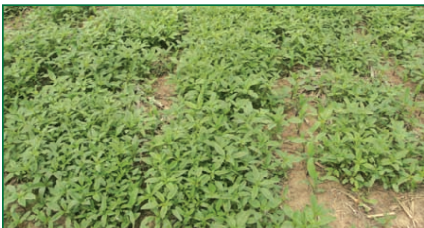
Figure 4. Waterhemp gains a competitive advantage over other plants because of high densities.

Although several summer annual weeds are more competitive on a plant-for-plant basis, waterhemp gains a competitive advantage through the sheer number of plants infesting an area (Figure 4). Seasonlong competition by waterhemp (more than 20 plants per square foot) reduced soybean yields 44% in 30-inch rows and 37% in 7.5-inch rows (Steckel and Sprague, 2004b). Waterhemp that emerged as late as the V5 soybean growth stage reduced yields up to 10%.