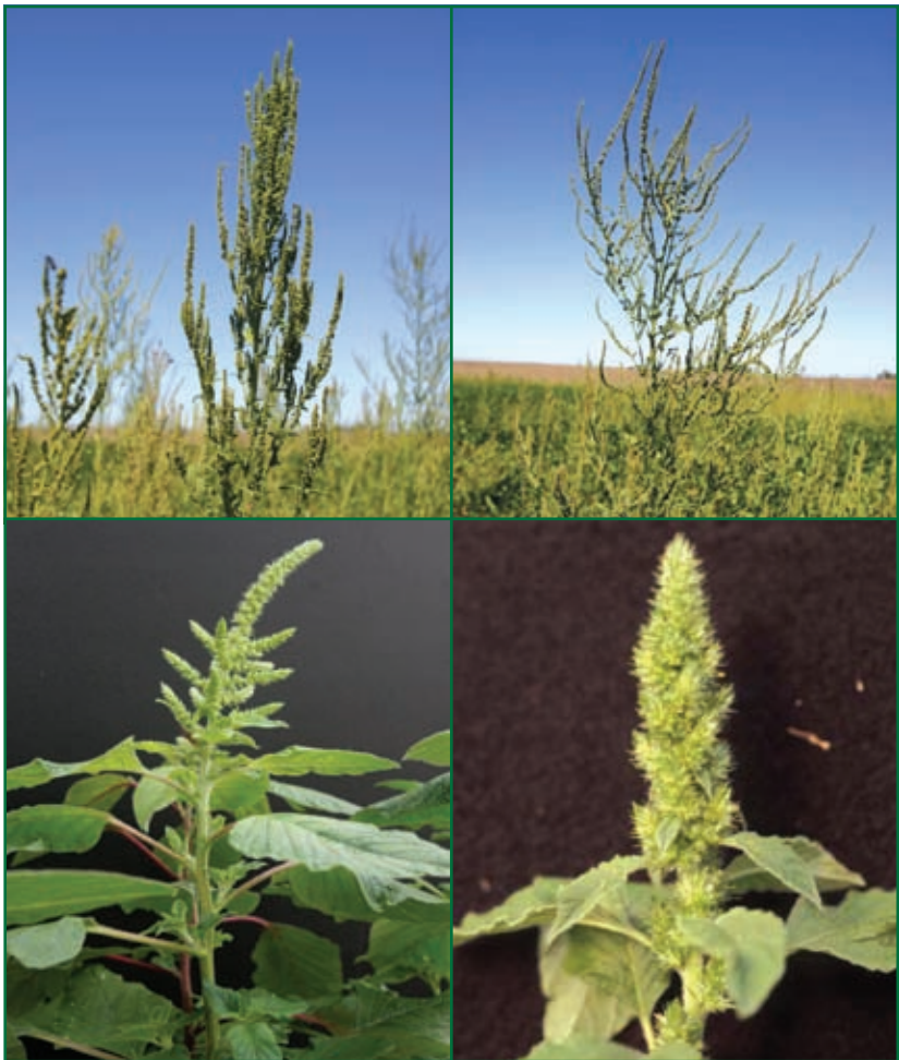
Figure 2. (Clockwise from top left) The seedheads of male waterhemp, female waterhemp, redroot pigweed, and smooth pigweed.

Palmer amaranth also is dioecious; whereas redroot and smooth pigweeds are monoecious (that is, the same plant has male and female flowers). Redroot and smooth pigweeds have denser, more compact seedheads than waterhemp, and Palmer amaranth has long, mostly unbranched, prickly seedheads (Figure 2).