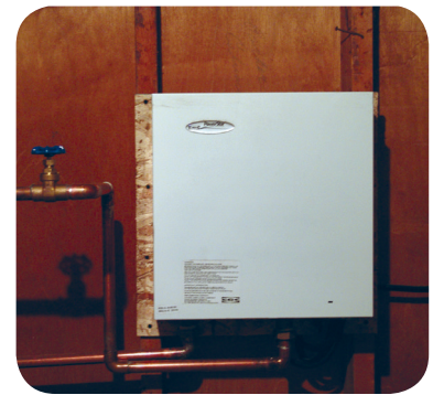
Tankless hot water heater

Most water heaters keep water heated at all times, whether needed or not. Powered either by gas or electricity, tankless water heaters save energy by heating water only when it is needed. A flow sensor detects when the hot water faucet is turned on or the hot water selection is made on an appliance. For a gas-