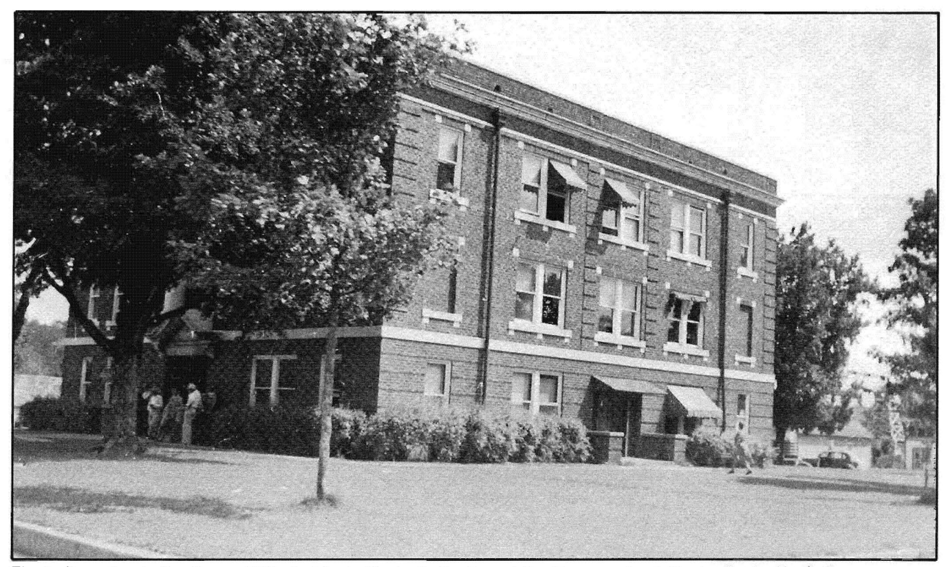
Fig. 2. Stone County Courthouse, 1920-. Architect: Charles Sudhoelter and Co. (From: postcard, Trenton Boyd collection)

Goodall and Bradshaw. Apparently, an additional appropriation of $986 was required to complete construction on the hip-roofed, two-story frame. It may have had a cupola. Exterior stairs led from each side to the center door upstairs. The court accepted the courthouse May 4, 1874.