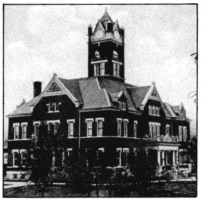
Fig. 2. Perry County Courthouse, 1904-. Architect: J.W. Gaddis