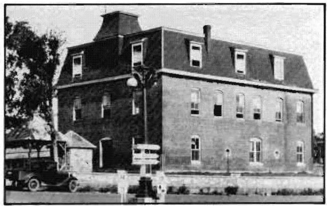
Fig. 2. Oregon County Courthouse, after 1903 remodeling. (From: Oregon County's Three Flags, 1971)

1871 after the foundation had been cleaned out. Since Fig. 1 is an undated photograph, it may be the 1861 or 1871 building. If it is the 1861 courthouse, the 1871 rebuilding may have used the segmental arches.