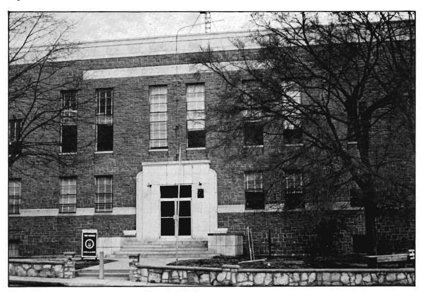
Fig. 3. Orcgon County Courthouse, 1939-. Architect: Earl Hawkins

Oregon County citizens preferred using local stone, but Ironton red granite was finally chosen since it cost less than quarrying native Oregon County stone. The court received the building from the W. P. A. in February 1942 (Fig. 3).