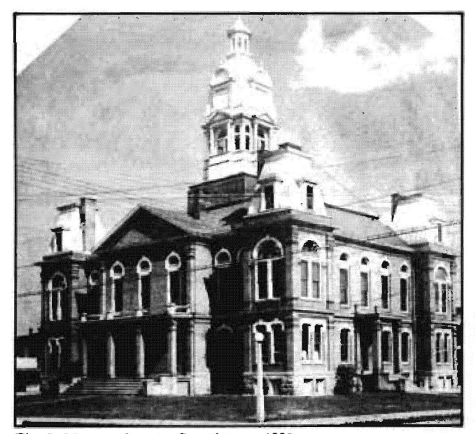
Fig. 2. Morgan County Courthouse, 1889-. Architect: William F. Schrage