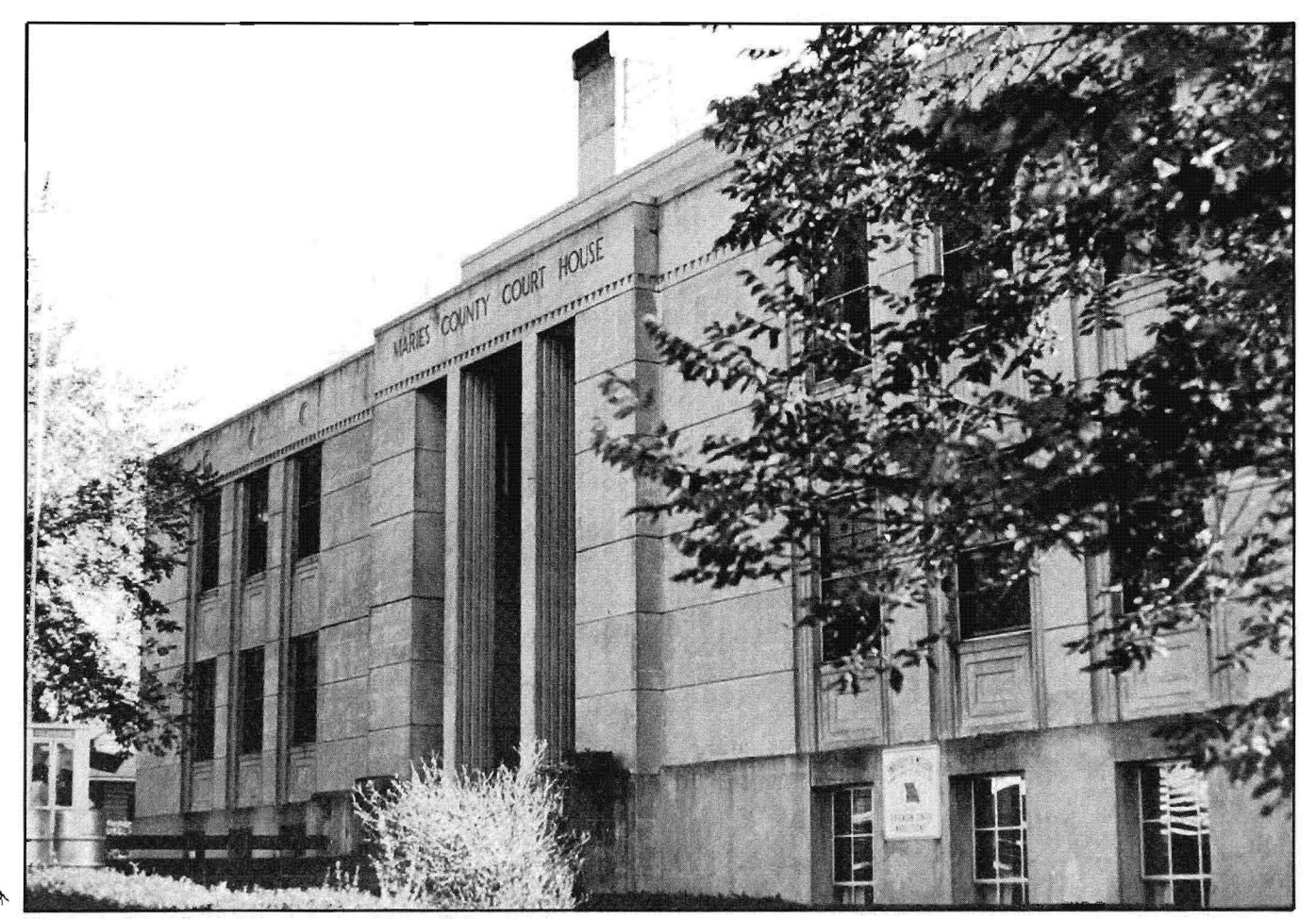
Fig. 2. Maries County Courthouse, 1940-, Architect: Macon C. Abbitt

stone and concrete. About $90,000 was the investment considered: Work Projects Administration funding $50,000, supplemented by a bond issue proposal for $40,000. The following month the Belle Banner urged community support; the editorial cautioned that federal aid would not last forever. County residents voted approval in January 1940.