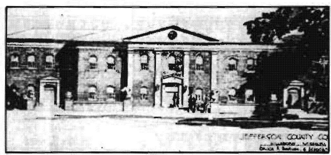
Fig. 3. Proposed 1953 remodeling. From: Jefferson County Record. December 3, 1953.

line distinguished this simple brick courthouse. The court accepted the completed building on July 5, 1865. County offices were on the first floor, the Circuit Court room on the second.