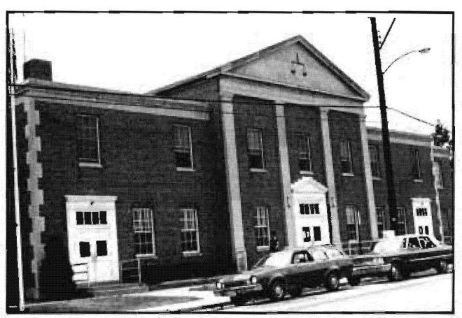
Fig. 4. Jefferson County Courthouse, after 1954 remodeling. Architect: Bruce Barnes and Associates

Originally, the plans called for features reminiscent of the 1865 courthouse: round, arched, multipaned windows and ornate cornice. Wings were to be added on either side of the principal entrances, which featured pilasters (shallow rectangular projections from the wall) designed to suggest a columned temple front (Fig. 3).