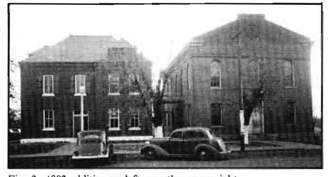
Fig. 2. 1892 addition on left; courthouse on right.

Roche and Erisman submitted a bid of $3,800, which the court accepted. Subsequent appropriations raised the cost to over $4,000. This building apparently continued in use until the 1863-65 building replaced it.