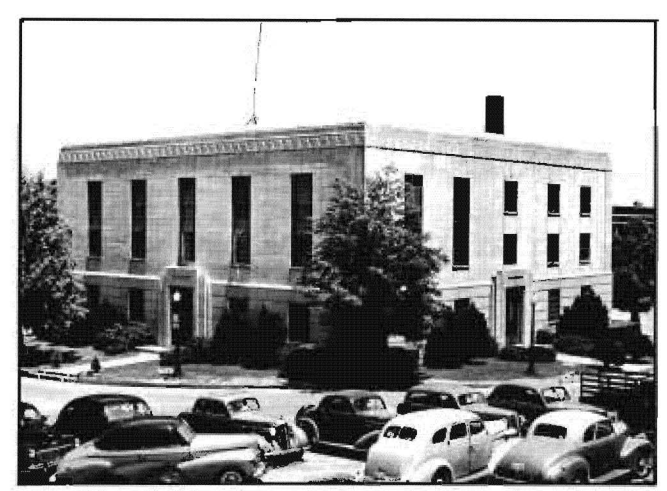
Fig. 2. Howell County Courthouse, 1935-. Architect: Earl Hawkins

(From: West Plains Journal, June 17, 1937, courthouse dedication issue)