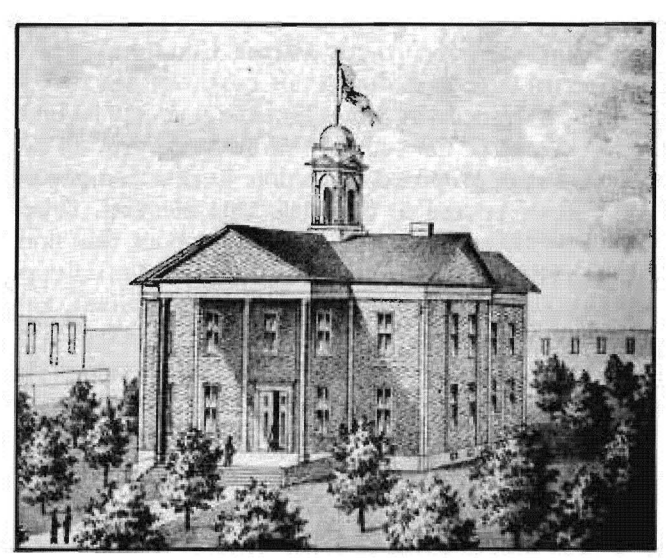
Fig. 1. Proposed Carroll County Courthouse, 1867. (From: An Illustrated Historical Atlas Map of Carroll County, 1876)