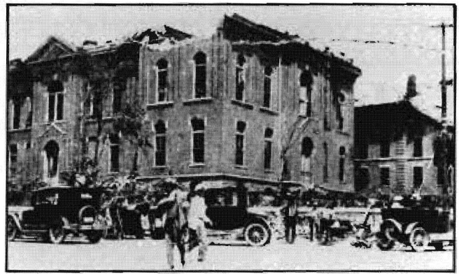
Fig. 3. Butler County Courthouse, after 1927 tornado.

A successful bond issue authorized expenditure of $250,000 in November 1927. George Gassman received