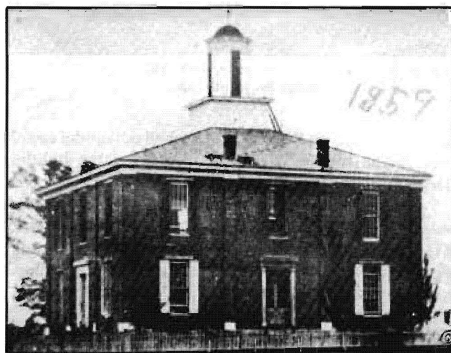
Fig. 1. Butler County Courthouse, 1858-1886.

The court authorized funds for the second courthouse from the sale of 10,000 acres of swampland (at not less than $1.00 per acre), which was the only source of income to finance such a project. Commissioners also had the option of trading swampland to the contractor as compensation. The court appointed three commissioners in April 1858 who were to furnish plans and superintend construction. After serving for some time, one commissioner resigned, and finally all three