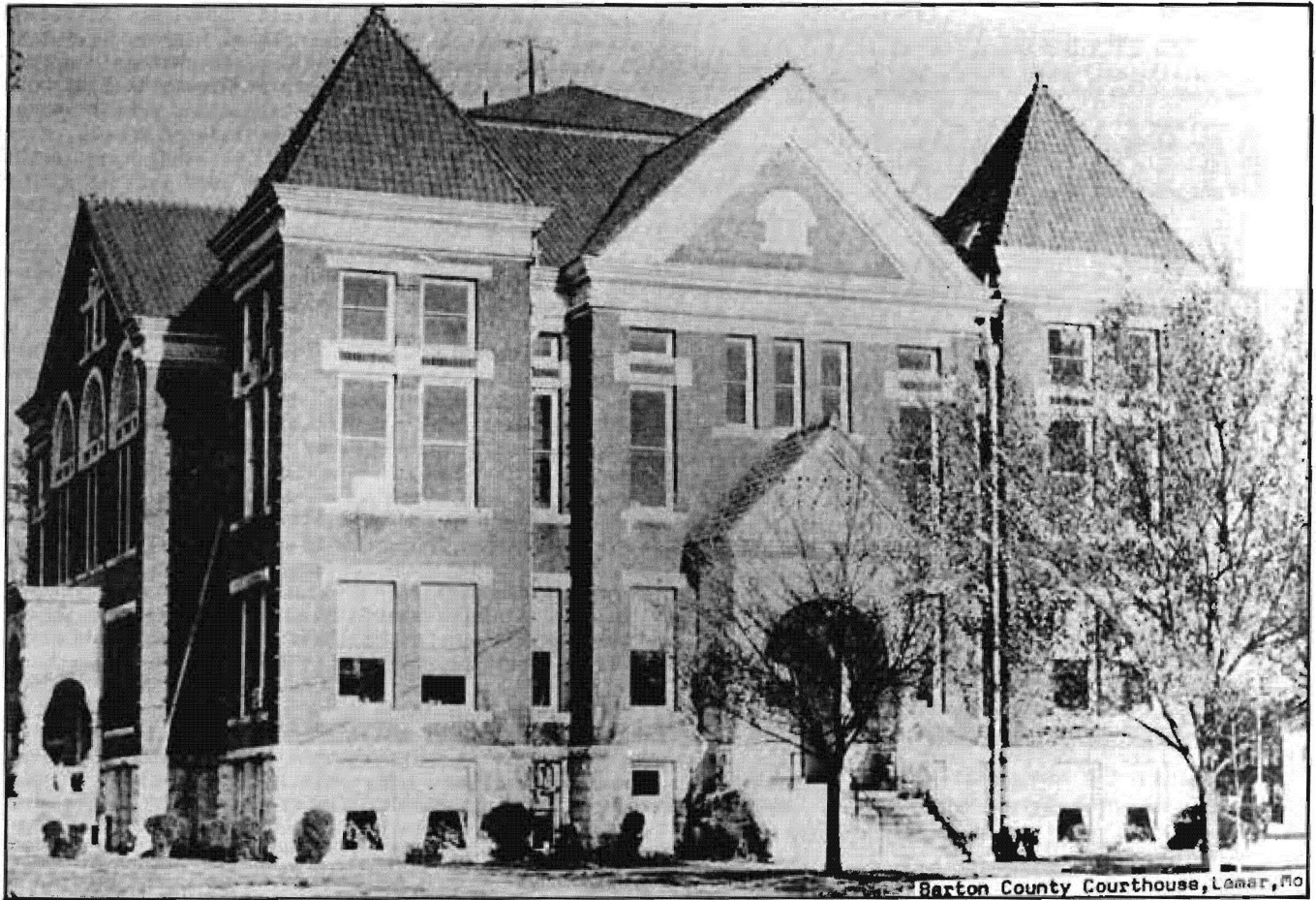
Fig. 2. Barton County Courthouse, 1888-, after roof alteration.

permanent building. At that time it was sold, moved and diverted to other uses.