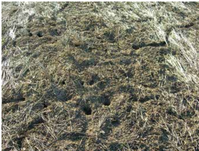
Figure 5. Small rodents, such as the prairie vole, can damage trees, fruits, vegetables and row crops by their feeding and tunneling activity.

water, cover, space — that would attract nuisance wildlife in your area.