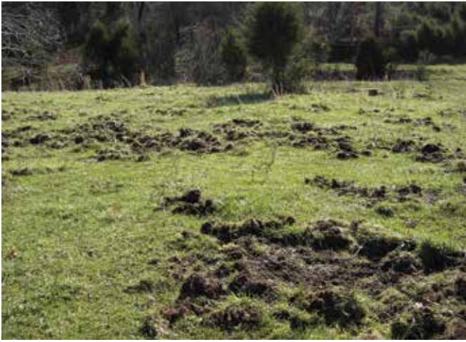
Figure 2. Feral hogs can damage a pasture or field by their rooting activity.