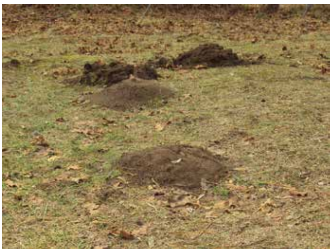
Figure 4. Moles can be a nuisance and cause damage to lawns and turf grasses by their tunneling activity and pushing up soil into mole hills.

Review plans and eliminate features that would attract nuisance wildlife. Examine your proposed land-use plans, landscaping layout or building design for their potential to provide any of the important habitat components — food,