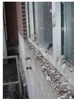
Figure 3. Pigeon droppings can be a health hazard.

Other control options to reduce wildlife damage should be tried before shooting is initiated. Before