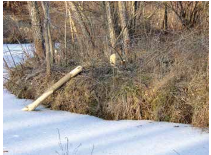
Figure 1. Beavers can damage or kill trees and cause problems when their dams flood timber and bottomland crop fields.

The presence of wildlife around your home or on your property is typically beneficial, but potential problems are caused when wildlife conflict with your goals and objectives. Landowners and homeowners need to be both tolerant of