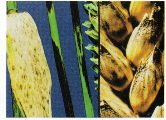
12. Septoria leaf and glume blotch (S. nodorum). L, leaf and R, glume symptoms