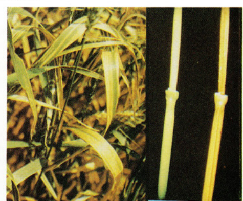
15. Cephalosporium stripe. L, leaf and R, culm symptoms (left culm is healthy)