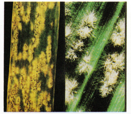
14. Powdery mildew. L, black specks (cleistothecia) in older colonies