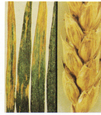
8. Black chaff. L, leaf and R, glume symptoms