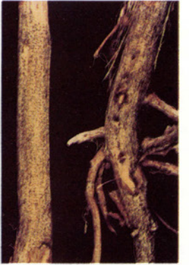
6. Charcoal rot