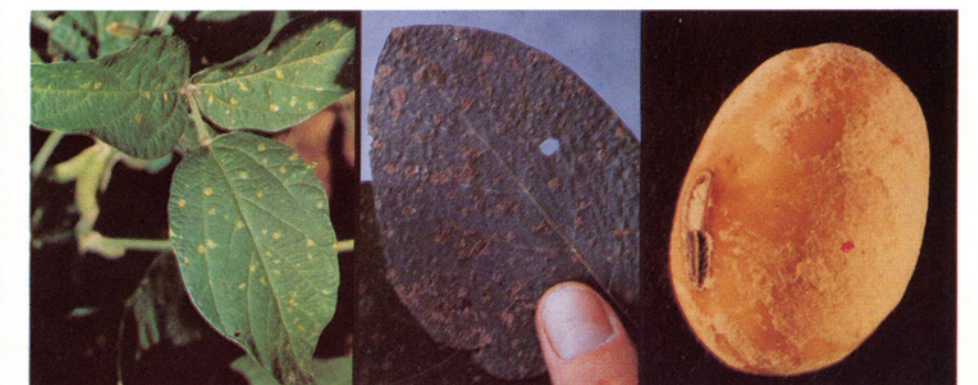
13. Downy mildew. L, upper and C, lower leaf surface; R, infected seed