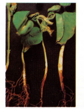
Rhizoctonia 2. root rot