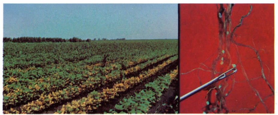
3. Soybean cyst nematode. L, field damage; R, cysts on roots