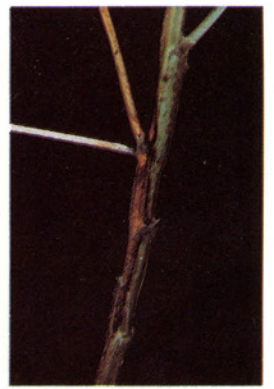
11. Stem canker