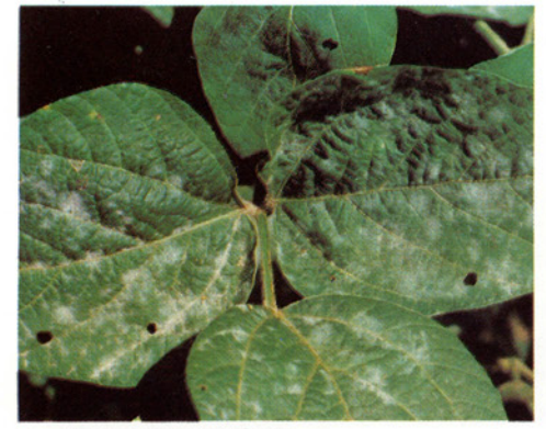
8. Powdery mildew