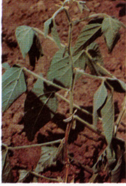
4. Phytophthora root and stem rot