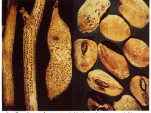
12. Pod and stem blight. L, pycnidia on stems and pod; R, infected seed