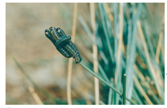
European pine sawfly

Full-grown caterpillars are nearly 1 inch long. They have shiny black heads and green and black thoracic legs, and the body has longitudinal (and alternating) pale green and gray-green stripes. There are eight pairs of white prolegs. The caterpillars are gregarious and primarily feed on the old needles (previous year's foliage). Preferred host plants are Scotch, red, jack and Swiss mountain pines, although white, Austrian and ponderosa pines are also attacked.