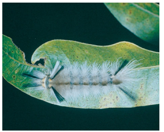
Pale tussock moth

This caterpillar is often called the "weather worm" because in folklore the width of its black bands indicates the severity of the coming winter. Full-grown caterpillars are a little over 1 inch long and are covered with tubercles from which arise stiff hairs of about equal length. Middle segments of the abdomen are covered with red-orange hairs and the anterior and posterior ends with black hairs. Hair color and pattern (band width) are highly variable; often as the caterpillar matures, black hairs (especially at the posterior end) are replaced with orange hairs. Host plants are mainly weeds and other noncrop plants such as dandelion, dock, aster, goldenrod, plantain and some grasses.