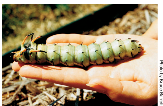
Hickory horned devil

This fierce-looking caterpillar is the immature stage of the regal moth. Full-grown larvae are dull green and can reach lengths of 4 to 5 inches. On the thoracic segments behind the head are long, stout, orange and black spines or "horns." The longest of these horns are found on the second and third thoracic segments. Six smaller black spines are found on each abdominal segment. Host plants include hickory, walnut, butternut, sumac, persimmon, sweetgum, ash and sycamore.