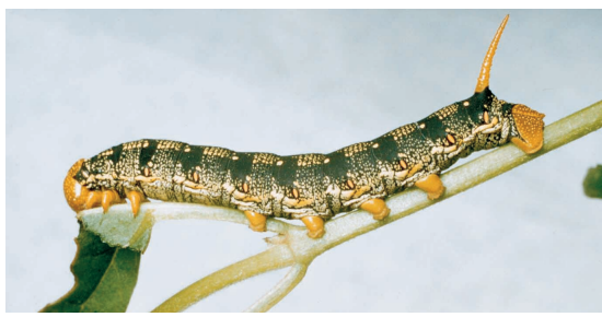
Catalpa sphinx (light form)