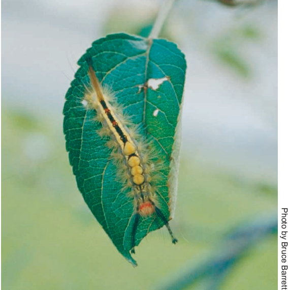
Whitemarked tussock moth

Full-grown caterpillars are 1–1.5 inches long. Arising laterally on each side of the first thoracic segment (which is red) is a group (or pencil) of long black hairs that point forward past the red head. Similarly, a single group of backwardpointing, black hairs arises at the end of the abdomen. On top of the first four abdominal segments is a densely packed tuft of yellow or white hairs, and on the remaining abdominal segments is a longitudinal black line of short hairs bordered by yellow hairs. In the center of this black line on the sixth and seventh abdominal segments is a bright red spot. On each side of the body are tufts of white-yellow and black hairs arising from a row of tubercles. Host plants include many hardwoods and conifers, with preference to apple, basswood, elm, poplar and maples.