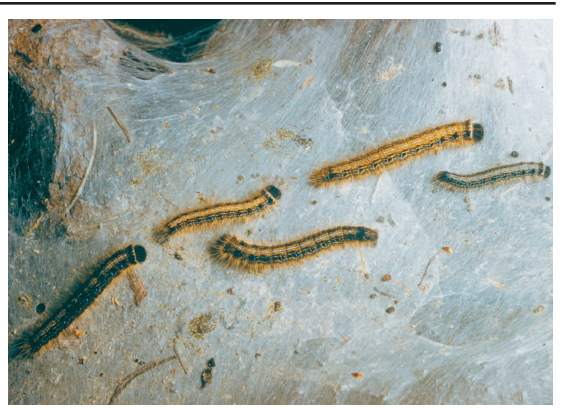
Eastern tent caterpillar

Full-grown caterpillars are mottled with a middorsal longitudinal, white stripe outlined by a narrow black line and bordered by a concentration of orange, wavy lines. Laterally, the body may have orange stripes, but there are blue and white markings on each segment just above the spiracles. Arising from the sides of the body are light-brown hairs. Host plants include apple, cherry, peach and plum, with serious damage often occurring on wild tree hosts. For control options, see MU publication G7271, Insect Defoliators of Missouri Trees: Web Producers .