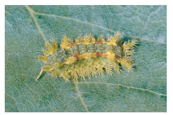
Spiny oak slug

The overall body color is green with spots of yellow, orange and red (usually on the top). Both edges on the top side and the lower lateral sides are covered with stiff lobes containing stinging spines. Host plants include oak and a variety of other forest trees and shrubs.