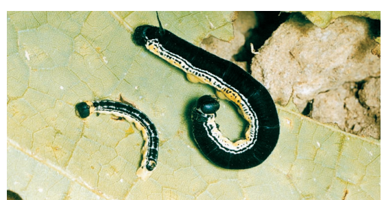
Catalpa sphinx (dark form)

There are two variable color forms, dark and light, of the caterpillars. Caterpillars with the dark form have a solid, broad, black stripe on the top of the body with yellow and white markings on the side of the body. The head and horn are also black. Light-formed individuals are pale yellow in color with patches of black on the top of the body, and the head and horn are yellow-orange. Full-grown caterpillars are about 3 inches long. The only host plant is the catalpa tree, and caterpillar numbers may reach such levels as to cause severe defoliation. For control options see MU publication G7270, Insect Defoliators of Missouri Trees: Colony Feeders .