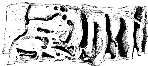
Figure 2. Carpenter ant gallery.

pile accumulating just below the nest entrance hole. This pile may include other debris from the nest, including bits of soil, dead ants, insect parts and other food remnants. They cut galleries along the grain of the wood, preferring the softer spring grain. They leave the harder summer grain, which serves as walls separating the tunnels. They cut openings in these walls to allow access between tunnels. Carpenter ants keep their galleries clean; the tunnels look smooth as if sanded (Figure 2).