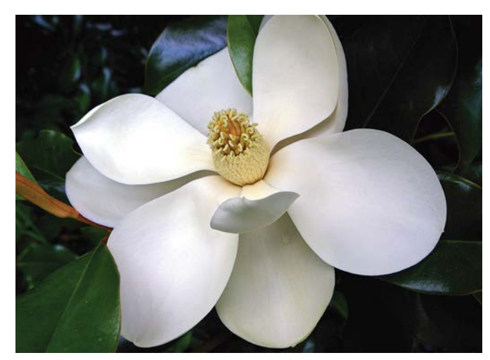
Figure 1. Southern magnolia is one of many broad-leaved evergreens popular in Missouri.