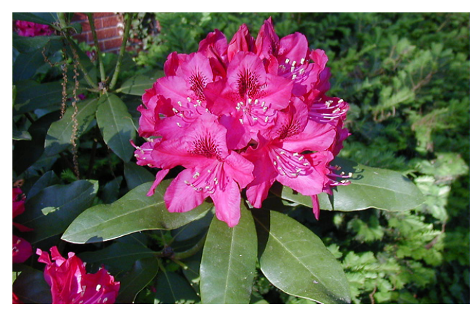
Figure 3. Rhododendron catawbiense, 'Nova Zembla,' is one of the hardiest evergreen rhododendrons.

in other areas of the state should be used as a large shrub, although it will eventually develop into a small tree.