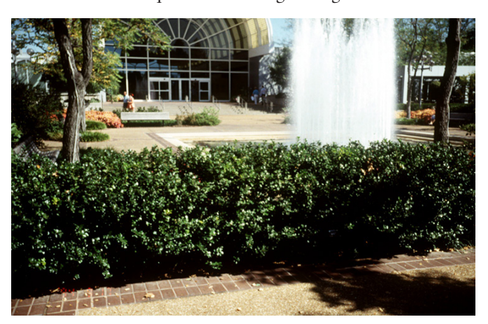
Figure 4. 'Blue Prince" holl will grow 8 to 12 feet high but can be pruned into any shape.

This slow-growing plant with spreading, arching branches and dark lustrous leaves produces fragrant, bell-shaped flowers in early spring. Drooping leucothoe needs shade for best growth and therefore is most suitable beneath large evergreens. It is related to Japanese andromeda and requires the same growing conditions.