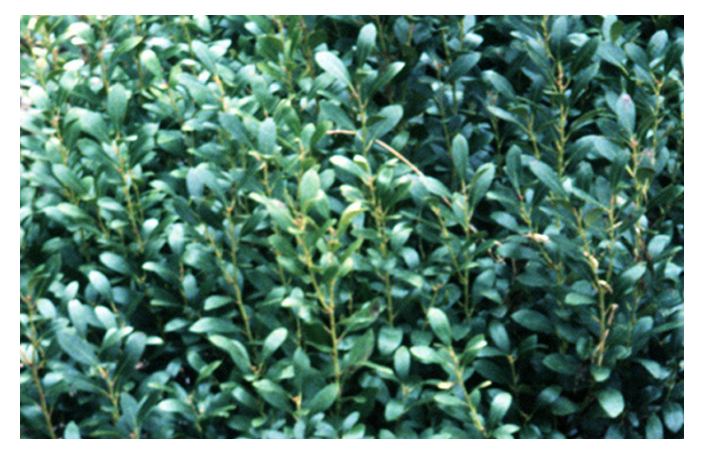
Figure 5. Inkberry is among the hardiest of the hollies.