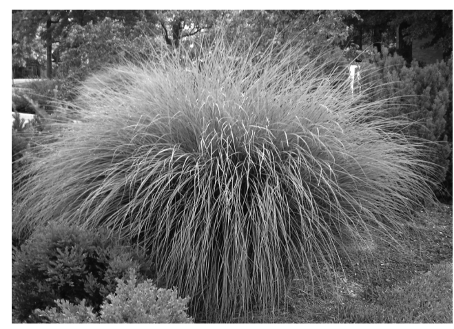
Figure 1. Like many other ornamental grasses, maiden grass requires little care and adds interest to garden landscapes.

Ornamental grasses can also be classivied according to their growth habit. Most ornamental grasses form clumps, rendering them noninvasive and suitable for use as specimen plants or for massing. These grasses exhibit a wide array of architectural forms, including tufted, mounded, upright, upright divergent, arching and upright arching (Figure 2). The shortest ornamental grasses usually exhibit a tufted habit of growth, and the tallest are upright arching in form. A second classification of ornamental grass according to their growth habit is spreading, or running. These grasses creep or