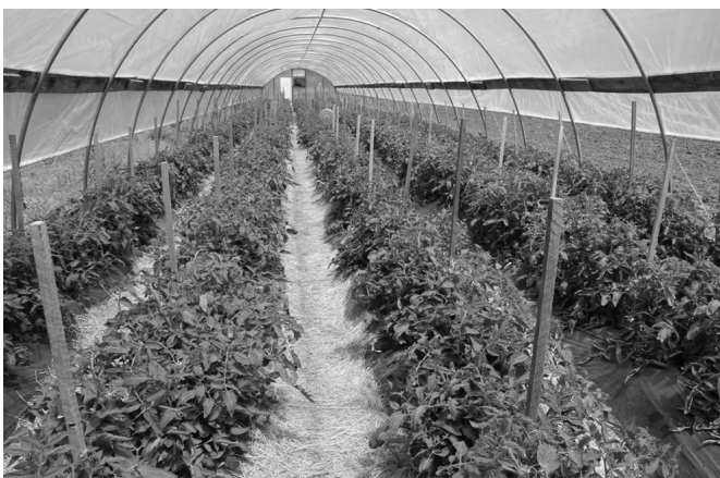
Figure 1. A high tunnel is a low-cost, solar-heated greenhouse that can extend the growing season of some vegetables, such as tomatoes.

Another distinct advantage of drip irrigation is the capacity to inject water-soluble nutrients through the irrigation system, a technique called fertigation. This technique allows nutrients and water to be applied as the crop grows, rather than all of the nutrients being applied at once, either during or before planting (Figure 1). Fertigation saves both water and fertilizer.