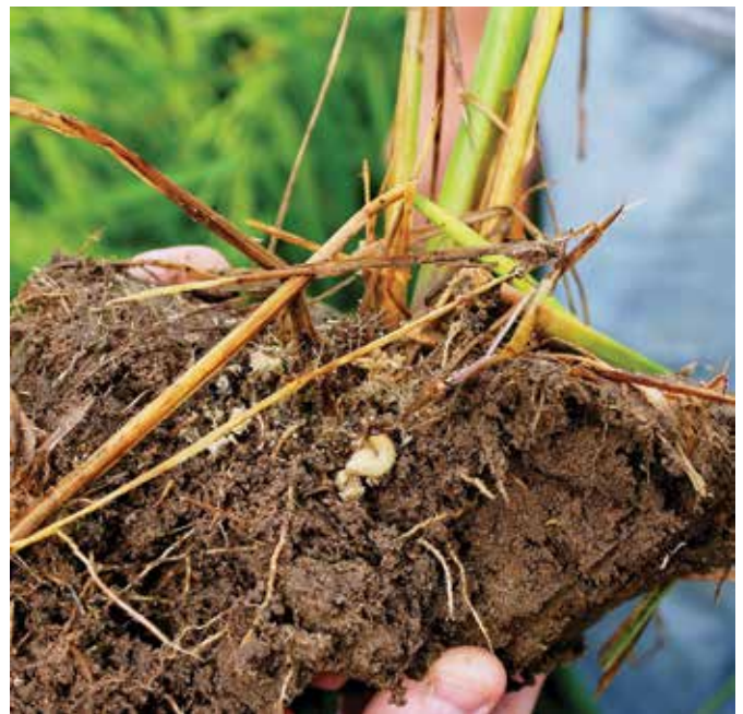
Figure 6. Billbug larvae (grubs) are white or light tan with curved bodies. They can be found below the soil surface feeding on rice roots.

Seed treatments are important for controlling early season infestations of grape colaspis, rice water weevil and billbugs. Billbugs are usually not a problem in flooded rice but can be devastating in furrow-irrigated rice. In the spring, billbug adult females lay eggs in rice stems near the soil surface. The larvae feed on rice roots, causing blank panicles, also called whiteheads (Figure 6). CruiserMaxx Rice or NipsIt Inside is used in seed treatments for grape colaspis and water weevils in flooded fields. A University of Arkansas study showed that they can also be used effectively in combination with Fortenza or Dermacor for billbug control in furrowirrigated rice. Rice fields should also be scouted for nymphs and adult stink bugs and sprayed if they exceed thresholds.