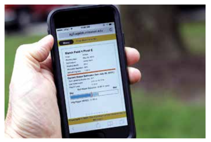
Figure 5. The Crop Water Use app for mobile phones was developed by the University of Missouri Extension service.

Farmers do not have time to manually calculate daily crop ET and soil water deficits from weather data for their fields. The main difference between extension irrigation apps is their interface design and ease of use. Growers usually just want to know which fields on their farm need irrigation today or in the coming week. Predictions such as crop growth from temperature are important but secondary. The University of Missouri Extension service released an irrigation app for mobile