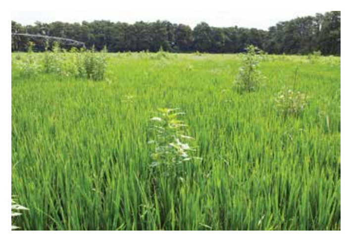
Figure 8. Propanil, 21 days after treatment.