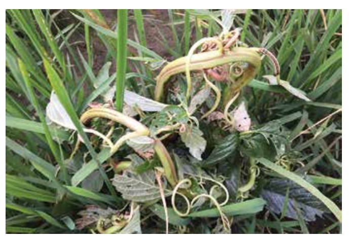
Figure 9. Pigweed sprayed with Loyant, six days after treatment.