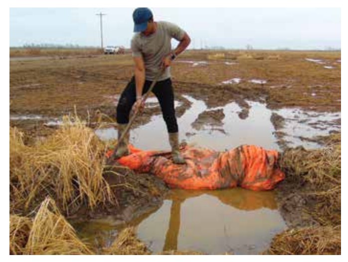
Figure 1. Furrow-irrigated rice requires less land and labor because rice leaves do not need to be removed before planting soybean.

In the Delta region, rice is normally rotated with soybean. With furrow-irrigated rice, less land preparation and labor are needed because rice levees do not need to be removed before planting soybean. During the rice season, floodgates need to be monitored