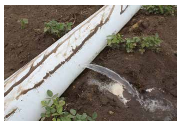
Figure 4. Holes are punched in lay-flat pipe to deliver water to row furrows.

In the past, farmers used rigid aluminum pipe to apply furrow irrigation to crops in the Delta region. Around 1990, rigid pipe began to be replaced by flexible, plastic lay-flat pipe. The tubing is u sually white in color and sold in large rolls. Generally, the thicker the mil of the plastic, the greater the pressure a pipe can handle without bursting. Most farmers use 9- or 10-mil thickness. A common type is a 15-inch diameter, 10-mil thickness that rolls out to a <sup>1</sup>/<sub>4</sub>-mile length and costs about $305 USD. It will handle up to 1,000 gallons per minute and 1.3 pounds per square inch pressure. Farmers with new wells are using 18-inch diameter pipe. Lay-flat pipe is usually installed with a "polypipe roller" implement which is mounted on the three-point hitch of a tractor. One end of the tubing is attached to a well pipe with nylon zip ties and duct tape. The tractor moves slowly across the end of the beds on the high end of the field. The roller has a small plow which cuts a groove in the soil, and the lay-flat pipe is rolled out in the trench. The shallow trench helps keep the tubing from shifting when irrigation water is pumped into it. It is best to install lay-flat pipe on a calm day to prevent the empty pipe from blowing away before it can be filled with water. After the pipe has water in it, wind is usually not a problem.