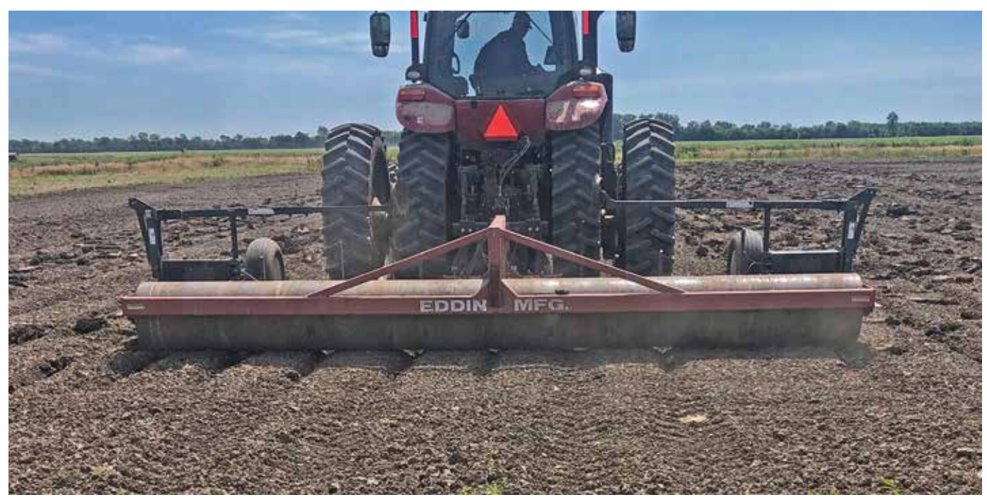
Figure 3. Beds should be made tall enough to keep irrigation water flowing correctly in furrows. Avoid making them too high or too wide, which prevents adequate water wicking in beds.

Sam Atwell, a rice extension agronomist, observed in a farm survey that some rice farmers were more successful than others at growing rice with furrow irrigation. He credited that in part to differences in management style but saw that soil texture and bed width in fields played a major role in producing high yields.