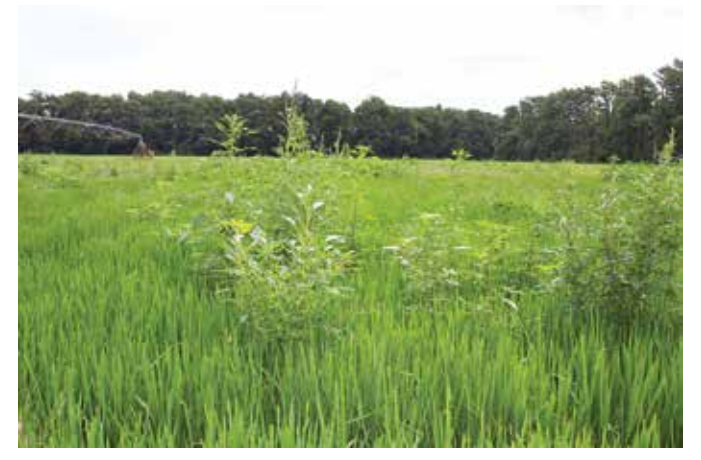
Figure 7. Untreated check.