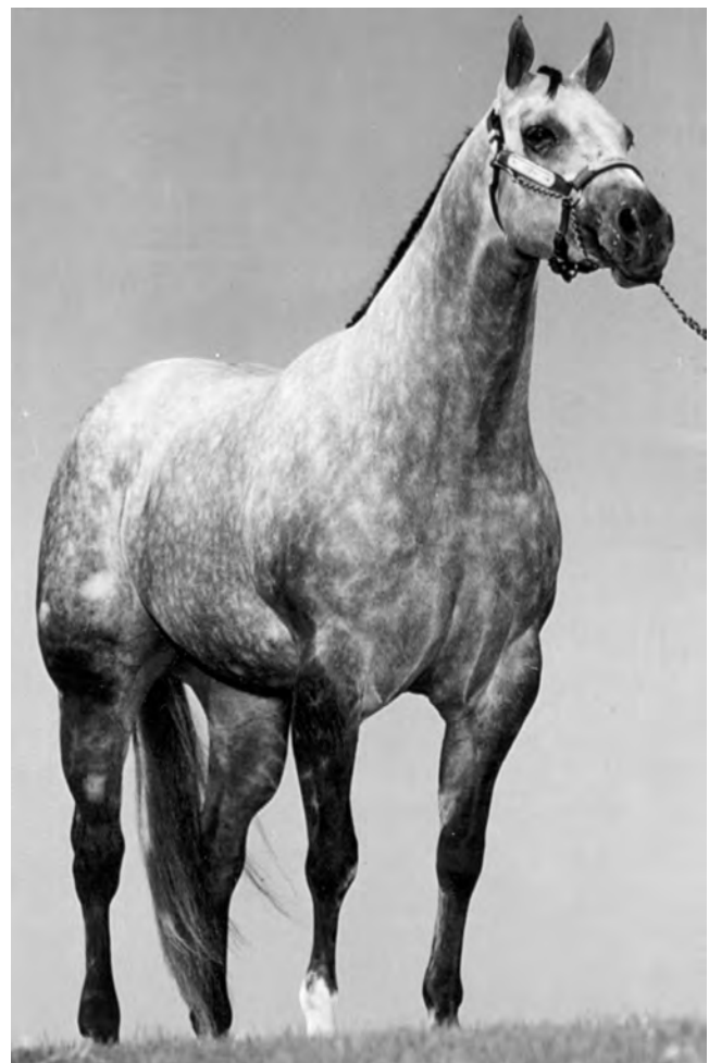
Figure 1. Good conformation includes proper balance and mass, structural correctness, and desirable breed and sex characteristics.

A horse's muscling should be long patterned and defined. Muscle mass can most easily be determined