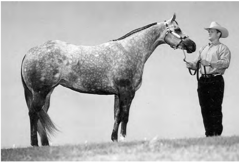
Figure 3. Long, sloping shoulders; short, strong back; long underline; and a long croup increase the probability that your horse can become a good “athlete.”