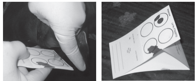
Figure 3. (left) Positioning a calf's ear to collect blood for FTA card preservation. (right) A properly collected blood sample on an FTA card.

Fold the card according to the manufacturer's instructions and allow the blood to dry for about an hour (Figure 3, right). Saturating the card with blood will not increase its usability and will increase the time necessary for complete drying. If the cards cannot be dried at the processing facility because of time or weather conditions, place them into individual plastic bags until they can be set out to dry. Placing multiple cards into the same bag before they are fully dry may cause cross contamination between cards. Complete