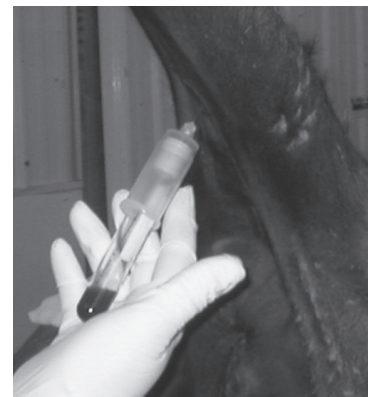
Figure 2. Whole blood collection from tail vein using a double-ended needle and blood collection tube.

needle. Then plunge the opposite end through the rubber stopper on the sample collection tube (Figure 2). Once the tube is full (8 to 10 milliliters), withdraw it from the needle, invert the tube, and shake it to mix the blood with the EDTA preservative. If you are collecting multiple samples from the same animal, leave the needle in the vein