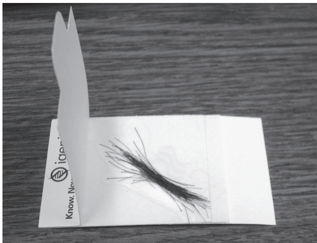
Figure 5. Placement of hair root samples on a collection card.