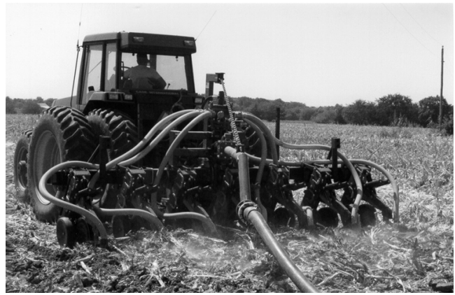
Figure 2. Injecting manure as a fertilizer for crop production.

Biochemical oxygen demand (BOD) is a measure of the amount of oxygen required to degrade organic