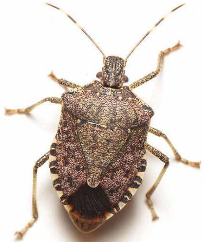
Figure 2. Adult brown marmorated stink bug. (Ken Childs)

Brown marmorated stink bug can be distinguished from native species by characteristic white bands on the antennae of both adults and nymphs (Figure 2). Additionally, adults have alternating light and dark banding along abdominal edges.