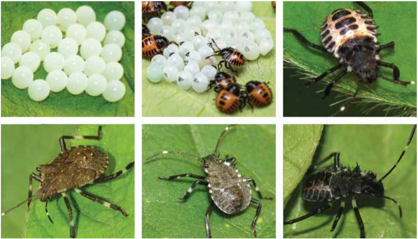
Figure 3. Brown marmorated stink bug life cycle: (clockwise from top left) eggs, first, second, third, fourth and fifth instar.