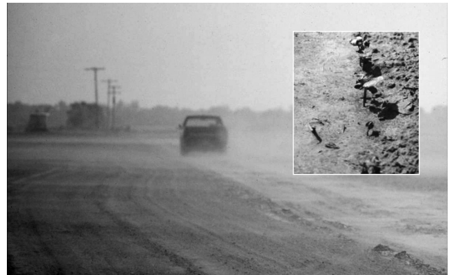
Blowing sand injures cotton seedlings (inset), delays maturity and reduces lint yields.

Soil temperature next to cotton plants was not reduced by winter wheat residue in the row middles. At first square growth stage, ridge-till cotton planted into killed wheat always averaged 1 to 3 inches taller