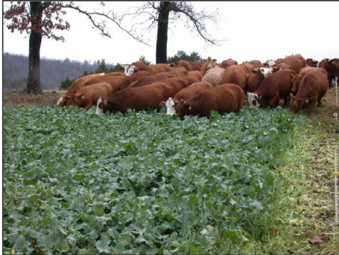
Figure 2. Cattle strip-grazing rape forage – White County ABIP Farm